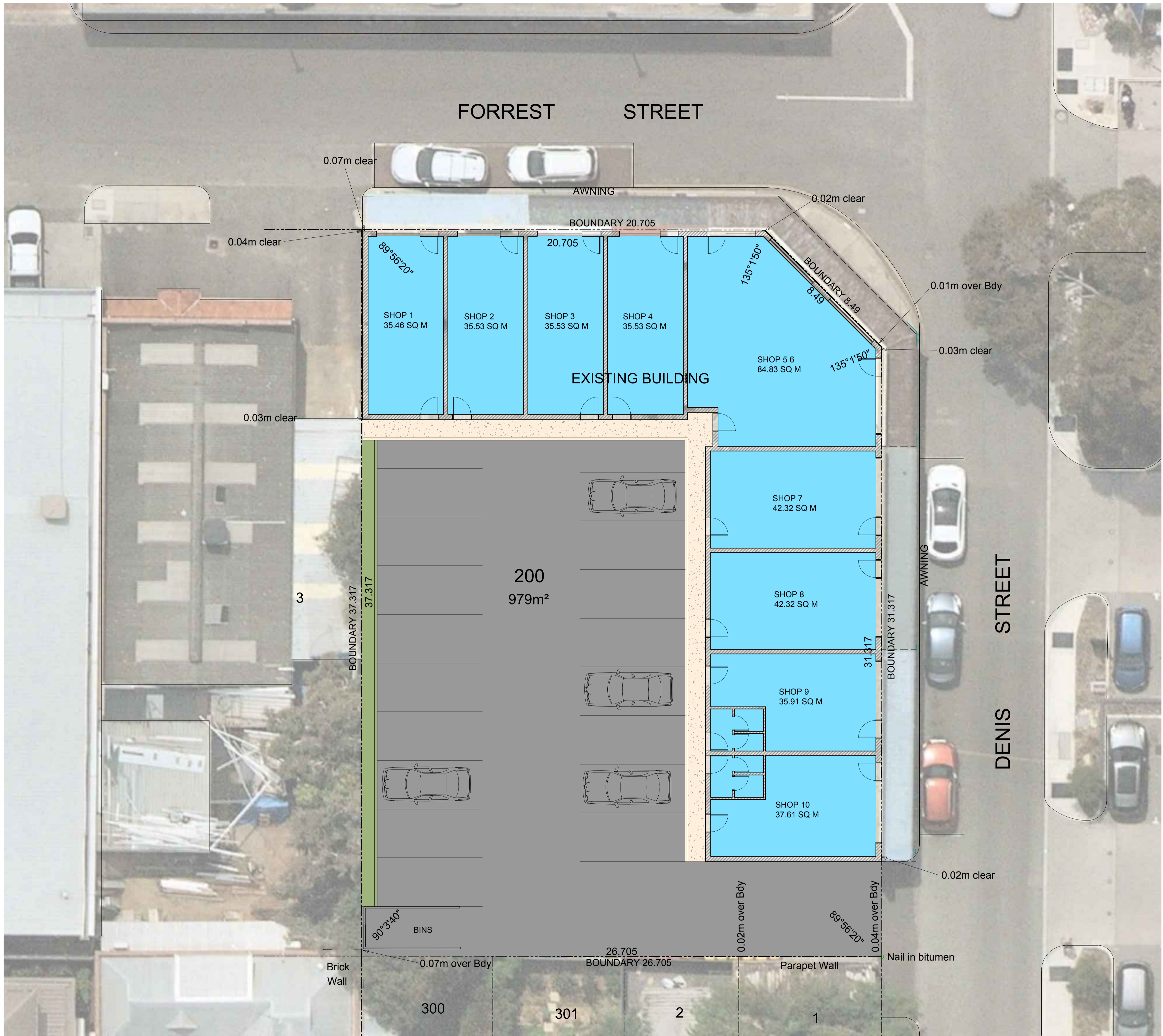
EXISTING SITE & FLOOR PLAN SCALE 1:100 @ A1 / 1:200 @A3

NOTE: SITE BOUNDARIES AND AREAS SHOWN ARE TO BE CONFIRMED BY A LICENSED SURVEYOR. TRAFFIC ENGINEER AND TOWN PLANNER REVIEW REQUIRED